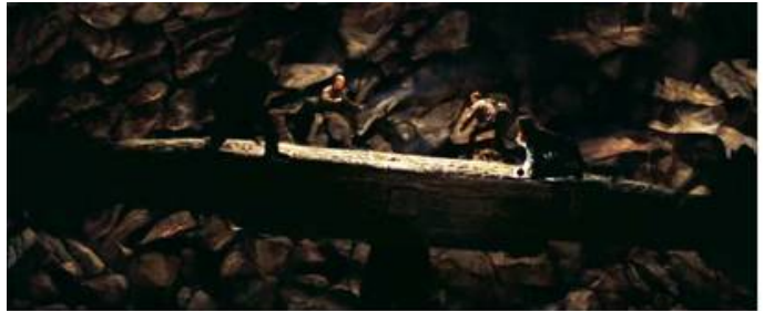
A plane of equal thickness is placed on a pillar and four persons jump on it.

Like the film there are four people in the group and to reach the treasure they have to jump on a plate that is placed on a pillar with sharp edge at the top. Before any of them jumps on the plate, it is in a stable position. For simplicity you can assume that the plate is rectangular in shape, has equal thickness at all places, it is solid and made of same material. Four people of equal weight jump on the plate at the same time but they can jump only at some certain points of the plate. So they cannot always jump in such a way that the plate is stable after they jump on it. Therefore after jumping on the plate they must run and change their position to make the plate stable again.