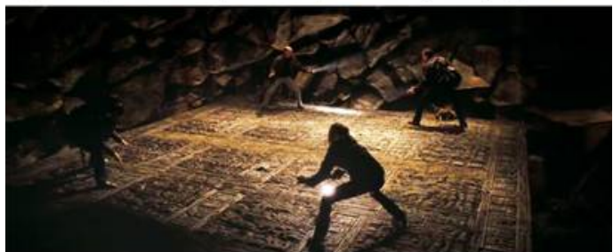
They run to change their position and keep the plane balanced.