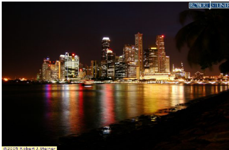
Skyline of Singapore at Night

The skyline formed by the first k buildings is the union of the rectangles of the first k buildings (see Figure 4). The overlap of a building, b_i , is defined as the total horizontal length of the parts of b_i , whose height is greater than or equal to the skyline behind it. This is equivalent to the total horizontal length of parts of the skyline behind b_i which has a height that is less than or equal to h_i , where h_i is the height of building b_i . You may assume that initially the skyline has height zero everywhere.