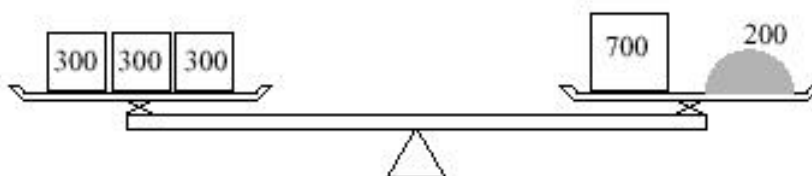
Figure 1: To measure 200mg of aspirin using three 300mg weights and one 700mg weight

You are asked to help her by calculating how many weights are required.